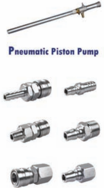
Pneumatic Piston Pump