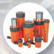
MULTI PURPOSE CYLINDERS