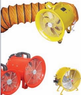
Electric & Pneumatic Blowers