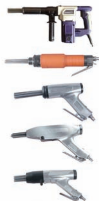
CE Electric & Pneumatic Needle Scaler