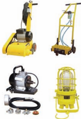
Deck Scaling Machine